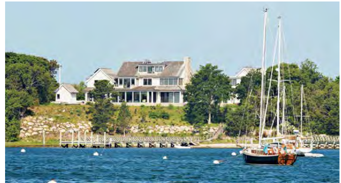
ABOVE: The vista-capturing house perches thirty feet above the water. The guest wing sits to the right of the main house, and the pool area is on the left. BELOW: The existing dock was updated to ensure safety. FACING PAGE: A second terrace, off the living room, increases the pleasures of outdoor living. Bright roses and sunny seat cushions add a dash of summer color.

As anyone with a nest by the water will tell you, company is a given from Memorial Day to Columbus Day. But with several guest rooms, nine bathrooms, and an elaborate guest suite that includes living and dining rooms as well as two bedrooms, crowds are encouraged at this address. In summer, there's almost always someone sunning on the terrace or splashing in the pool. The infinity edge, Solien points out, gives swimmers uninterrupted views at the harbor-facing end.