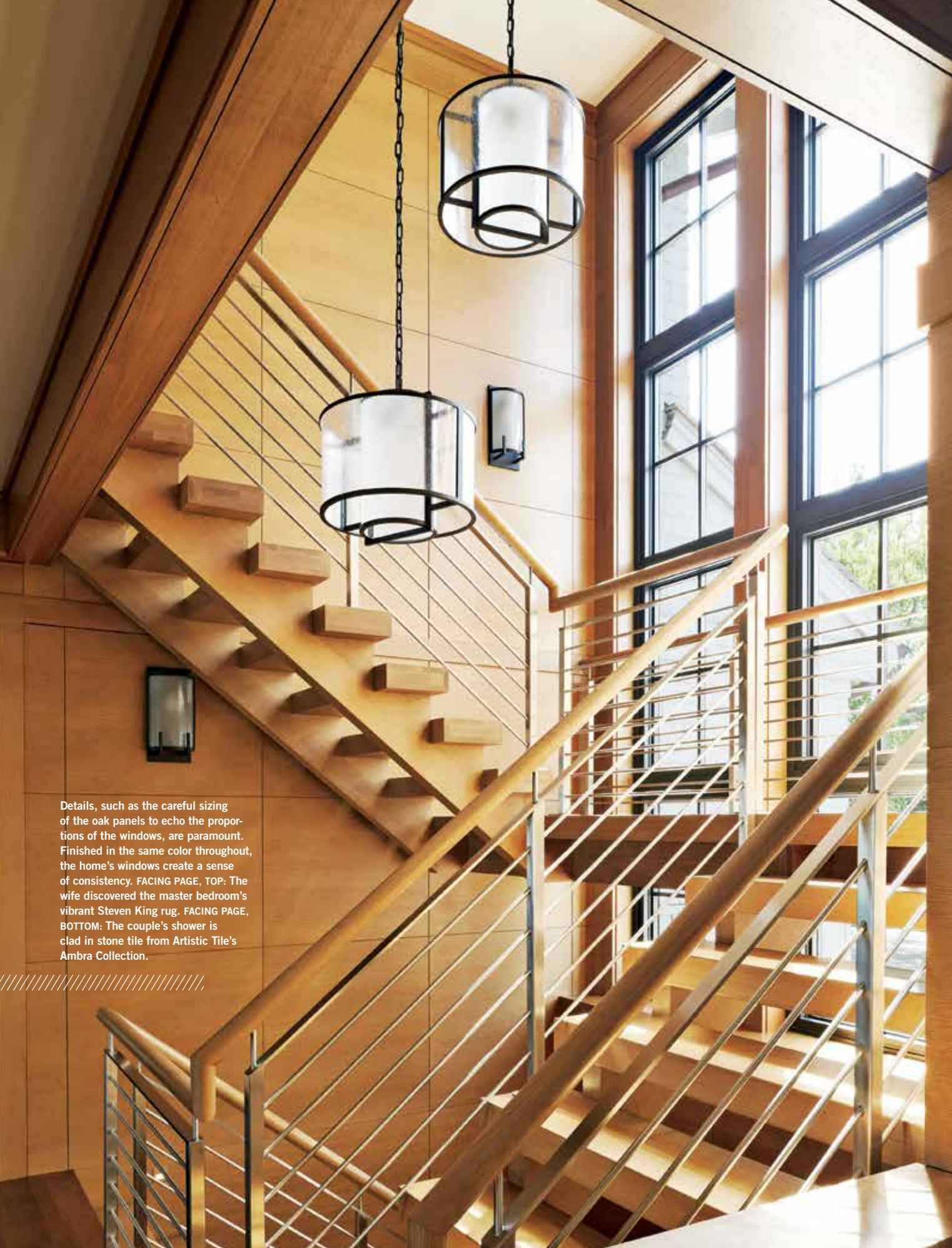
Details, such as the careful sizing of the oak panels to echo the proportions of the windows, are paramount. Finished in the same color throughout, the home's windows create a sense of consistency. FACING PAGE, TOP: The wife discovered the master bedroom's vibrant Steven King rug. FACING PAGE, BOTTOM: The couple's shower is clad in stone tile from Artistic Tile's Ambra Collection.

"I DECORATE WITH THE IDEA IN MIND THAT I WANT THE ROOM TO LOOK AS GOOD TEN YEARS ON AS IT DOES RIGHT NOW ," SAYS HEDGES.