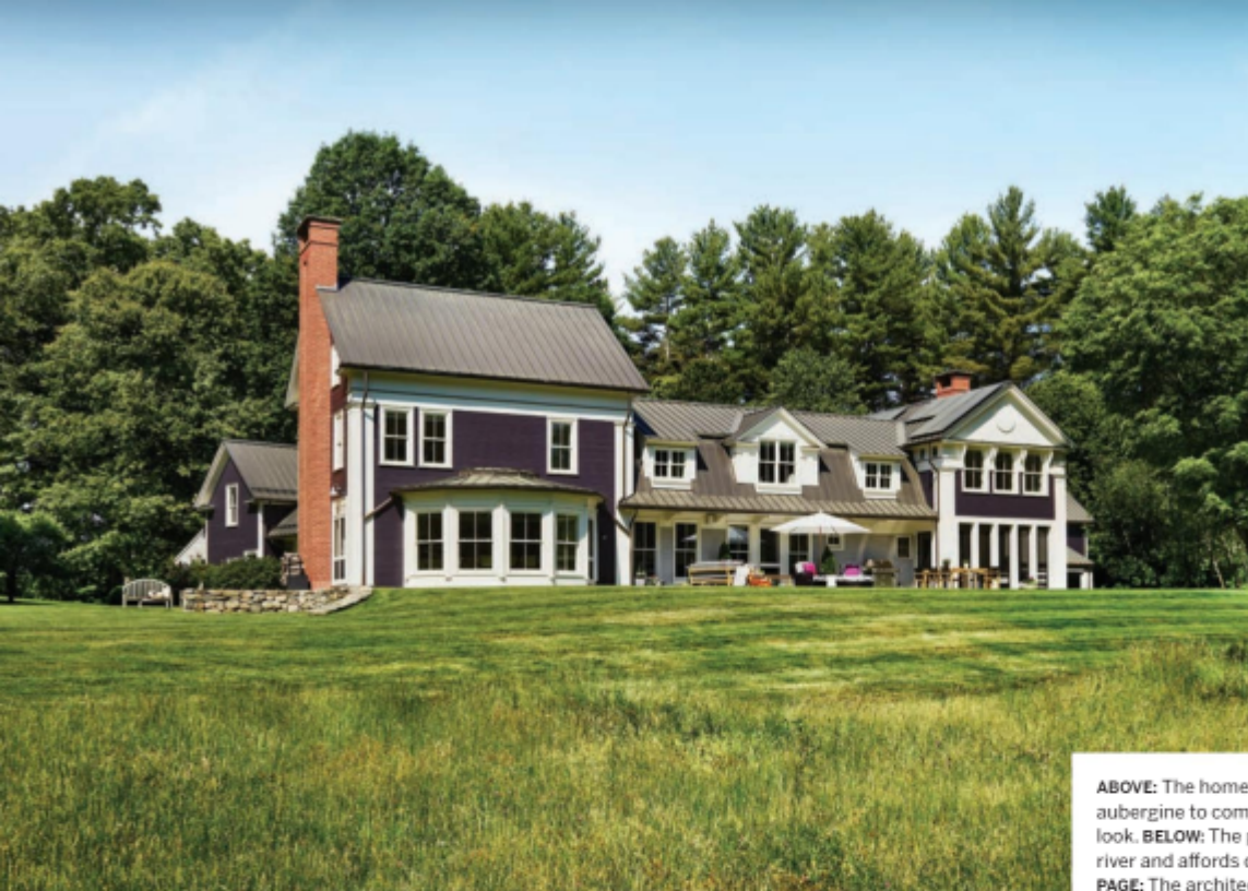
ABOVE: The homeowners chose a deep aubergine to complement the home's new look. BELOW: The property extends down to a river and affords distant water views. FACING PAGE: The architect reshaped the three dormers on the shingled connector section of the house to look more Greek Revival than farmhouse; a metal roof was also installed to accommodate solar panels.

clients' existing collection mingles with new pieces selected with Hirsch's assistance. She started from scratch when it came to the furnishings, designing several pieces and customizing others, all while ensuring that everything was consciously produced with the environment in mind (no plastics per the homeowners' request).