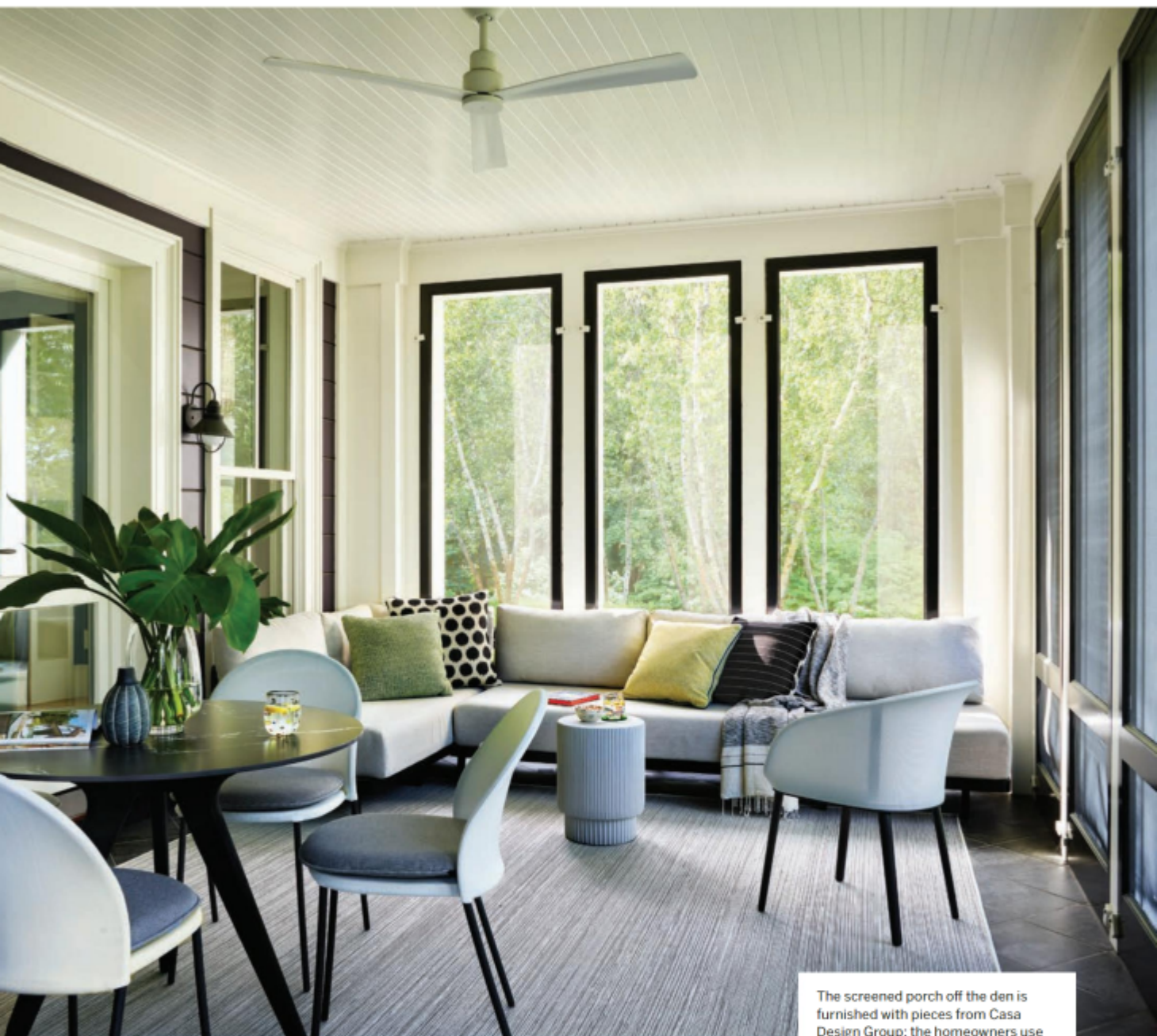
The screened porch off the den is furnished with pieces from Casa Design Group; the homeowners use this room for entertaining, dining, and games. FACING PAGE, TOP TO BOTTOM: The existing butler's pantry was also given a refresh, thanks to wallpaper from Brewster, Danby marble countertops, new fixtures and appliances, and Farrow & Ball's blue-black Railings on the cabinetry. In the mudroom, the designers reconfigured the layout and cabinetry, installed porcelain tile resembling slate on the floors, and painted the ceiling Benjamin Moore Wrought Iron.