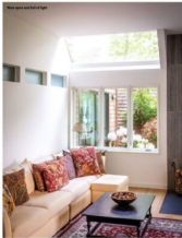
A new space and natural light.