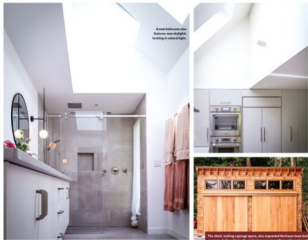
A new bathroom also features a new skylight to bring in natural light.