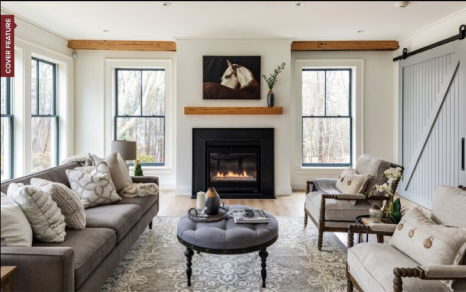
From a 100-year-old farmhouse to a beautiful, luxurious 1930s Colonial-style abode. The living room mantel and beams were created from salvaged timber.