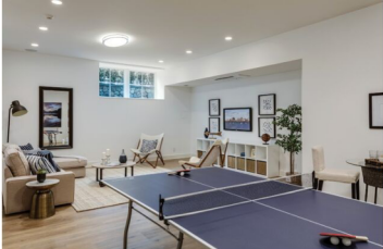
Below ground level is a beautiful recreation room with 10-foot ceiling height.