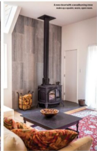
A new island with a wood-burning stove makes up a quiet, warm, open room.