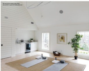
This area features shiplap, high ceilings, and a wet bar in a quiet and healthy yoga room.