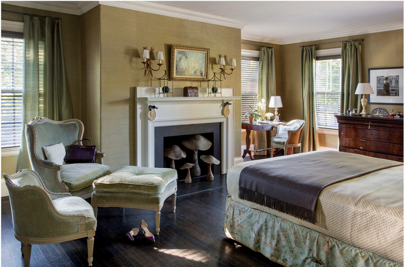
Carved wooden mushrooms from Paton's Mount Auburn Street shop grace the fireplace in one of the bedrooms.

But when Paton entertains, and she does often, guests are greeted with a sense of Old World grace. It begins at the front door, where the designer added a balustrade entryway, and continues into the newly paneled entrance hall, where an antique Macassar-ebony sideboard holds a collection of trumpet-shaped Italian Empoli glass. An adjacent dining room is swathed in Fromental handpainted-silk wallpaper that Paton spotted in Hong Kong, its fanciful design illuminated by a found assortment of green bell jars hung from the ceiling in lieu of a chandelier. It's sophisticated whimsy: When diners recline in the antique horsehair chairs at the Dessin Fournir rosewood table, it feels like a surrealist's gathering at a Stein salon in 1920s Paris.