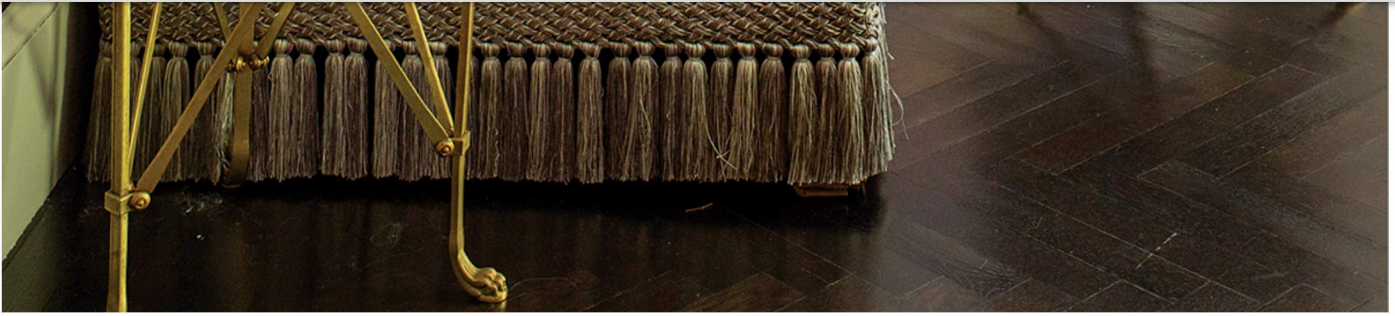
Paton's studylike living room features a mirrored wall that lends a contemporary, deco-tinged edge to the mix.