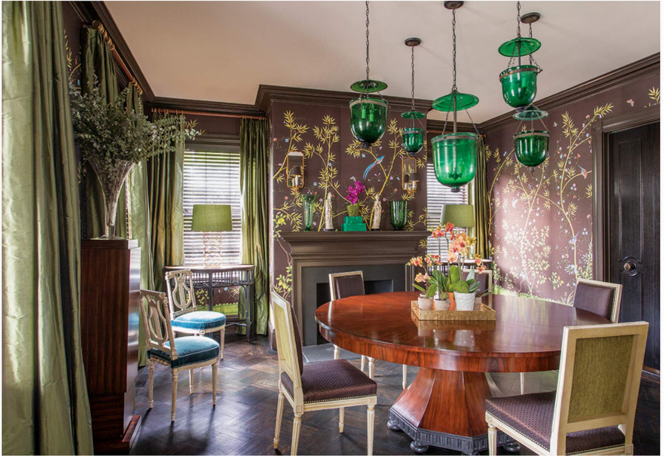
the chocolate-hued dining room offers a whimsical, salon-like setting with its handpainted, Far East-inflected design, which Paton first spotted in Hong Kong.