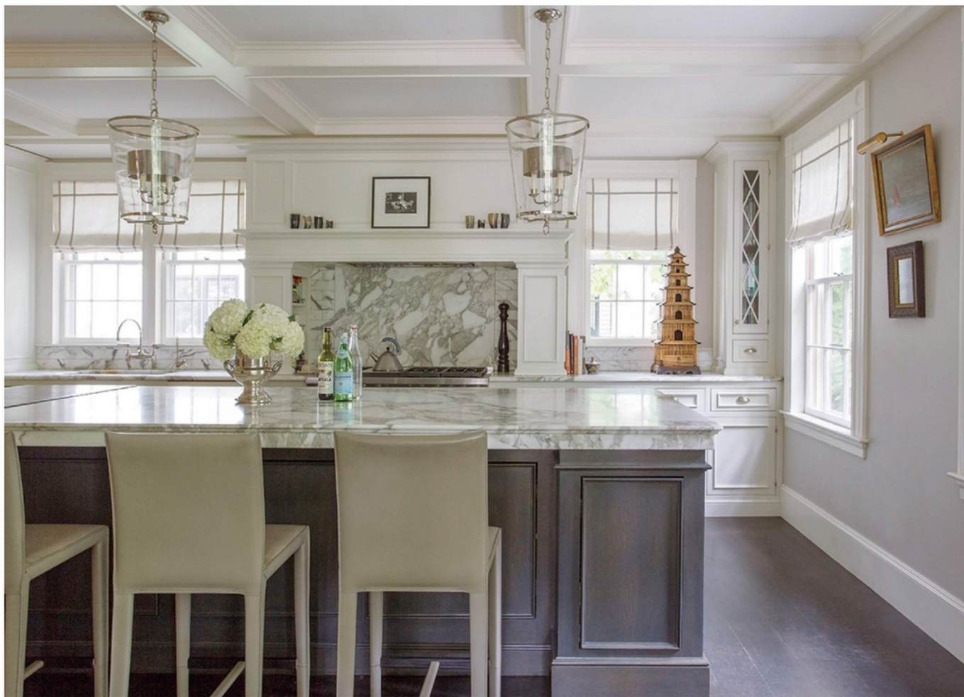
The bright kitchen features millwork by Rhode Island-based Herrick & White and Calacatta marble.

Casual get-togethers take place in the kitchen at a Calacatta marble countertop surrounded by Crate & Barrel barstools. Coffered ceilings add a classic touch that links the kitchen to a bistro-style dining nook inspired by weekends in Paris. The sumptuous chocolate-hued pleather banquettes (“It’s easier to clean when the soccer team is over”) contrast with slick mirrors, Biedermeier chairs, and antique lamps scored at a French flea market. “I love to build rooms that mix elements, the fine with the less fine,” says Paton, who installed French doors leading out to the spacious rear porch and grassy backyard, where a trellised terrace features Philippe Starck chairs around an outdoor fireplace. It is the perfect place to uncork a bottle from the wine room in the finished basement, which also includes a kid-friendly TV room, a gym, and a guest bedroom.