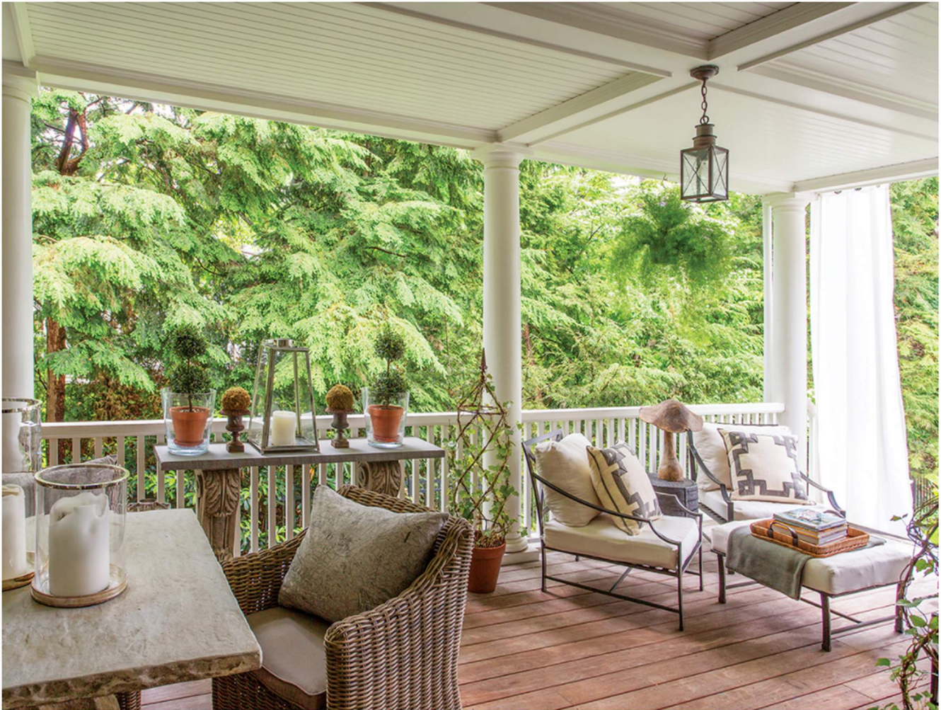
French doors lead to a spacious veranda and a backyard with a trellised terrace.