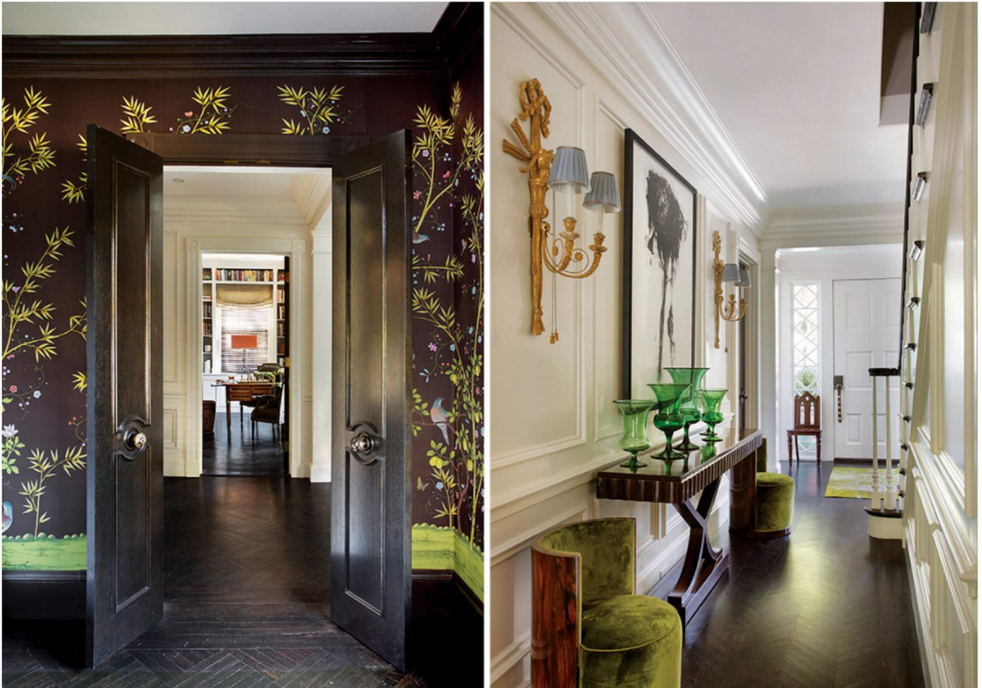
From left: ornate wooden doors adorn either side of the foyer; the home's foyer showcases a Macassar ebony sideboard and chairs procured from dealers of French antiques.