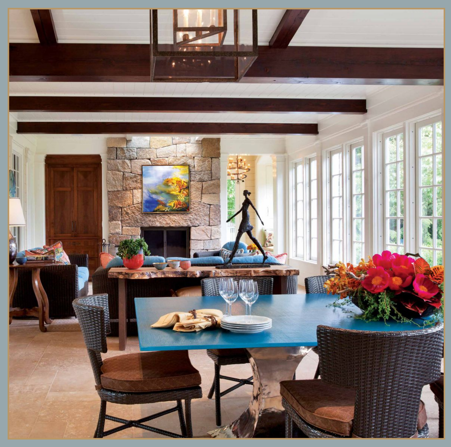
SEVENTEENTH ANNUAL EDITION

A guide to fine home furnishings, products and services